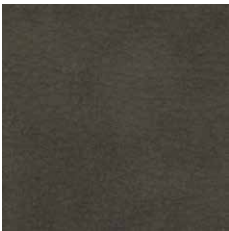
13081 Grey Olive