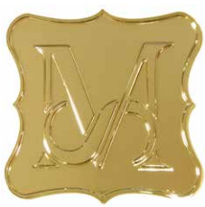
Aisi 314 + gilding